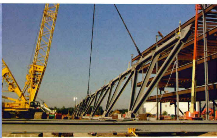
◀ Lifting the first truss section.