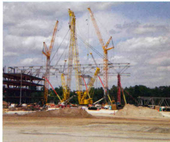
▲ The initial sway brace assembly being hoisted into place.