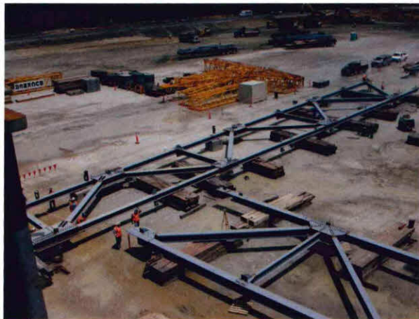
▲ The 610-ft-long trusses were assembled on the ground in two sections.